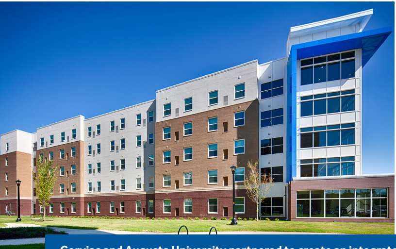
Corvias and Augusta University partnered to create an integrated housing program in one residential community.

Corvias partnered with Augusta University (AU) to develop, construct, renovate, manage, and maintain a new residential community, serving both undergraduate and graduate students, on the downtown medical campus.